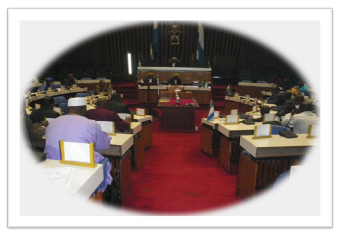
THE CHAMBER OF PARLIAMENT OF THE REPUBLIC OF SIERRA LEONE